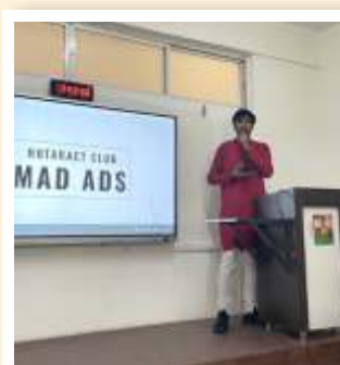
The participants advertising their eco-friendly products at Mad Ads event during Symphoria'2023

During Symphoria 2023, the Rotaract Club conducted the competition "Mad Ads". The event aimed to test participants' ability to think on their feet, communicate effectively, and showcase their salesmanship in a lively and entertaining manner. The competition highlighted the commitment to environmental sustainability as participants showcased advertisements and demonstrated their sales prowess while promoting eco-conscious products.