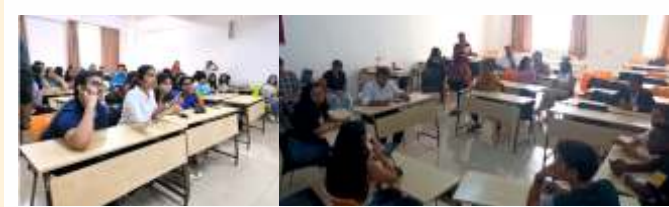
The Law Hawks Cell organised a Pop Culture Quiz during Symphoria'23

During Symphoria'23, Law Hawks Cell organised The Pop Culture Quiz 3, which featured four rounds. The event began with team-based rounds answering straightforward questions, followed by a musical round for teams to identify songs and sing the same, based on the words displayed. The third round focused on individual meme dialogue decoding, narrowing down to three participants. The final round included a rapid-fire. Just A Minute (JAM) was organised by the Law Hawks Cell for Symphoria '23 to test the contestants' ability to speak on a given topic for a minute in order to examine their wit, humour, and quick thinking.