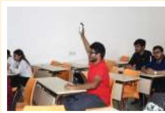
The Tech Legal Cell organised the "Know Your Tech" quiz competition using Mentimeter and Microsoft PowerPoint Presentation

The Tech Legal Cell strives to cultivate a learning environment that encourages and inspires students to engage with the evolving landscape of Intellectual Property and Technology Law. In