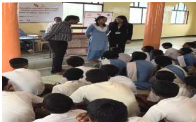
The CLCL cell team guided the students of Rihe village during the program of empowering the students of the village on the diverse career paths available to the youth.