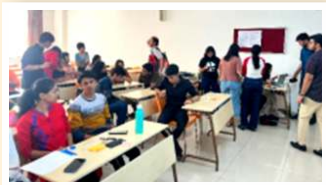
The Law Econ Cell organised the event "Who Will Be The Next Eco Geek" Quiz at Symphoria'23

The Law Econ Cell at Symbiosis Law School, Pune organised the quiz "Who Will Be The Next Eco Geek" during Symphoria'23, to test the participants' knowledge of global socio-economic and legal matters, and foster a sense of camaraderie amongst attendees. Participants were asked to guess a country based on a socio-economic clue. Furthermore, to sustain an element of excitement, they were given Nerf guns to target the right answer with the right shot on the world map. As the participants tried to decode the clues and pinpoint the countries on the map, cheers and shouts of encouragement filled the room.