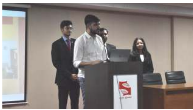
The Corporate law cell organised the Corporate Awareness Quiz during Symphoria'23.