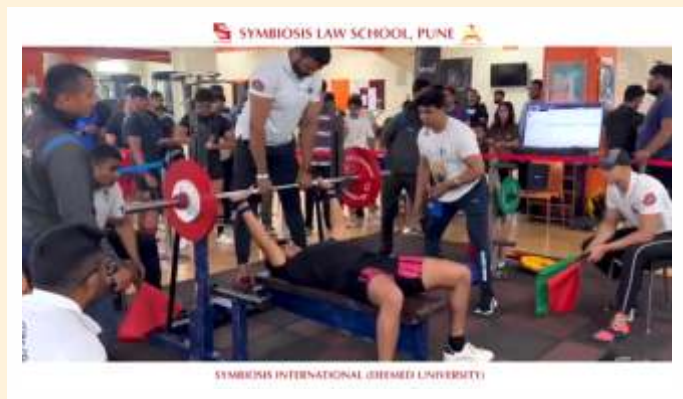
The Sports Cell organized the Inter-SIU Powerlifting Competition

The Inter-Institute Powerlifting Championship, hosted by the Department of Sports Recreation and Wellness (DSRW) in collaboration with Symbiosis Law School- Pune (SLS P), was held on September 5th and 6th, 2023. Athletes competed in three categories: Squats, Bench-press, and Deadlifts. A total of 91 men and 20 women representing 26 institutes across Symbiosis participated in the championship. The Sports Cell played a pivotal role in organizing and facilitating the event. The championship served as a platform for individuals from various backgrounds to come together, showcasing sportsmanship and a shared dedication to the sport. The event wrapped up with a closing ceremony at Symbiosis Law School- Pune on September 6th at 9:00 P.M.