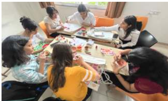
Tote-bag Painting Competition (Symphoria '23) organised by ECOCON Cell

During Symphoria'23, held on October 20th, 2023, the ECOCON cell orchestrated a tote bag painting competition. With sustainability at its core, this initiative aimed to enlighten students about the significance of embracing sustainable fashion and lifestyle practices.