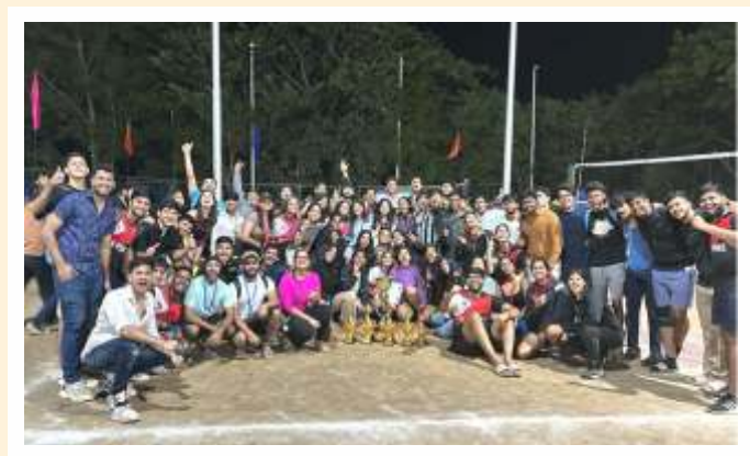
The Sports Cell facilitated in sending the contingent of Symbiosis Law school, Pune at the sports event: VIRUDHAKA 2023

The Inter-Institute Powerlifting Championship, hosted by the Department of Sports Recreation and Wellness (DSRW) in collaboration with Symbiosis Law School- Pune (SLS P), was held on September 5th and 6th, 2023. Athletes competed in three categories: Squats, Bench-press, and Deadlifts. A total of 91 men and 20 women representing 26 institutes across Symbiosis participated in the championship. The Sports Cell played a pivotal role in organizing and facilitating the event. The championship served as a platform for individuals from various backgrounds to come together, showcasing sportsmanship and a shared dedication to the sport. The event wrapped up with a closing ceremony at Symbiosis Law School- Pune on September 6th at 9:00 P.M.