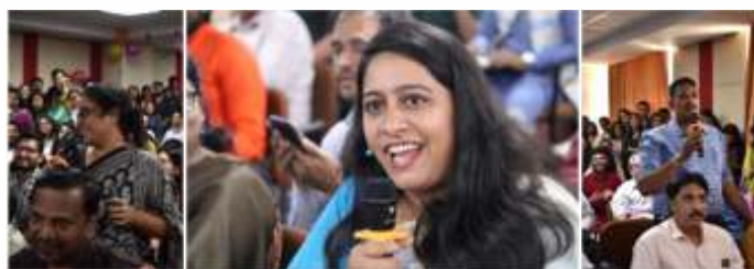
The students and faculty of Symbiosis Law School, Pune celebrating Teachers' Day on September 5, 2023