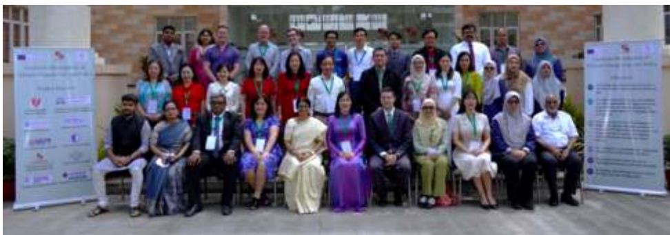
European EU Erasmus +KA2 Capacity Building Higher Education (CBHE) Project called the 'Curricula Development on Climate Change Policy and Law(CCP_Law)' with the delegates at the 4th Transnational Project Meeting held at Symbiosis Law School, Pune, Viman Nagar from 11th to 16th September, 2023.

JULY - DECEMBER 2023 Volume No. 23 - Issue No. 2