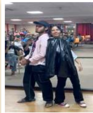
The Gender Champions cell organised the event of "Artistry in Diversity: Fashion for Every Gender" during SYMPHORIA '24.

The Gender Champions cell organised the 'Gender Bend' on October 19, 2023, as a part of Symphoria 2023: a unique and creative event that elevated the concept of face painting by encouraging self-expression. In defiance of prevailing gender norms, the intent behind the event was to commemorate individuals and empower them to freely express their individual identities. It aimed to encourage everyone to embrace their individuality and celebrate diversity amongst the students.