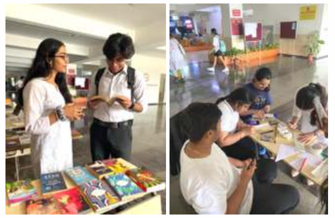
The Rotaract Club organised the Book Exchange event and bookmark-making competition

The Rotaract Club organized a Book Exchange event from September 25th to September 27th 2023, encouraging students to share resources for the collective benefit. Approximately 50 students exchanged over 120 books. Additionally, the students engaged in making bookmarks and participated in a vibrant social media contest. Thus, providing them with a platform to showcase their creative and artistic talents while also contributing to the community. The club had also planned to collaborate with the CLCL Cell post-event to donate the collected books to underprivileged students.