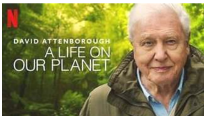
The screening of Netflix documentary "David Attenborough: A Life on Our Planet" was conducted by the ECOCON cell during Wildlife Week 2023

The initiative encouraged creativity, wherein cloth tote bags were used as canvases to paint environment-friendly slogans by the participants. It fostered awareness about the importance of adopting eco-conscious choices in everyday life and alternatives that minimise environmental harm. By exploring sustainable fashion through artistry, the event planted seeds of awareness and empowered students to become agents of positive change in their communities