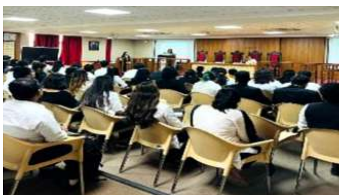
Students of LLB from SLS, Pune during the screening of the Netflix documentary "David Attenborough: A Life on Our Planet"

Wildlife Week is observed to reflect upon the well-being of our fauna. This year, the ECOCON Cell continued its tradition by screening the documentary for all batches of three-year and five-year LLB students on 25th October 2023. The goal was to educate and encourage thoughtful reflection on wildlife conservation through visual entertainment. We chose the critically acclaimed Netflix documentary "David Attenborough: A Life on Our Planet" to honour Attenborough's contributions and explore issues surrounding wildlife along with practical solutions.